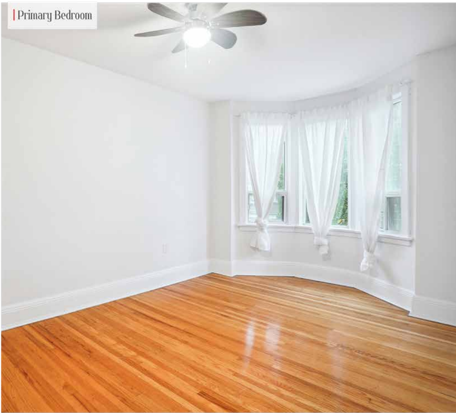
| Primary Bedroom